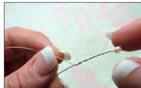
Starting a branch component