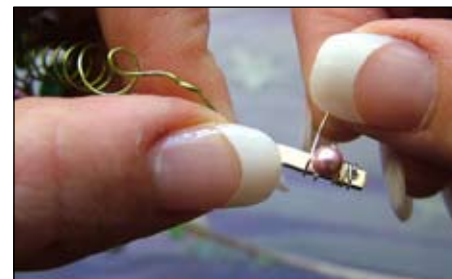
Starting a Robin's wrap